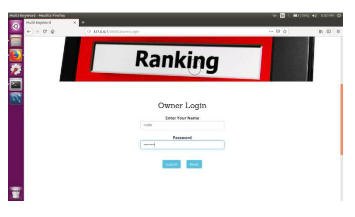
Fig -7: Owner Login