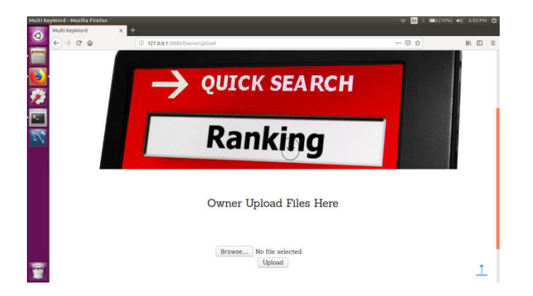
Fig-9: Owner Uploads