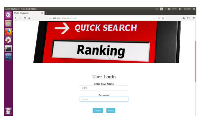
Fig-12: User Login