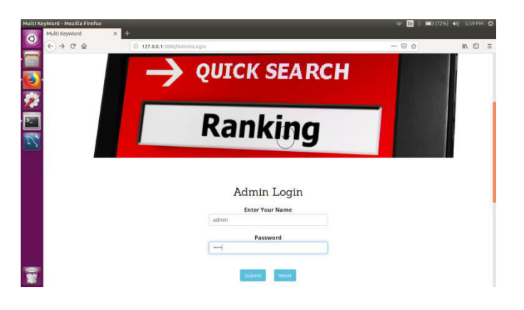
Fig -3: Admin Login