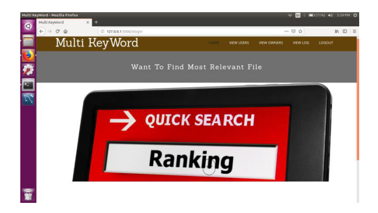
Fig-4: Admin Home page