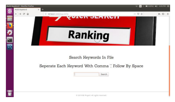
Fig-13: User's Search Page