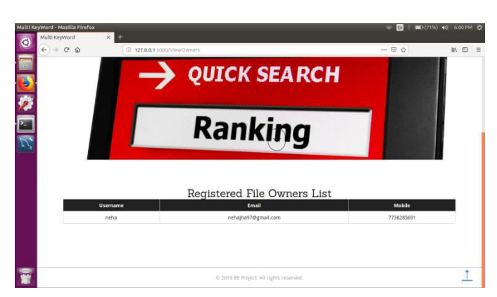
Fig -6: Registered Owner