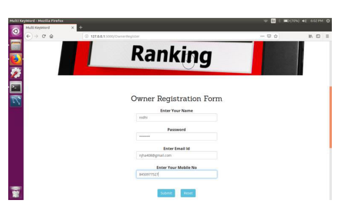
Fig-5: Owner Registration