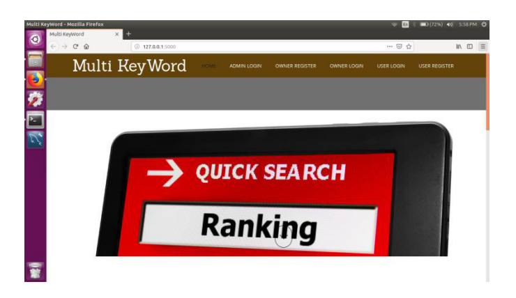
Fig -2: Home page