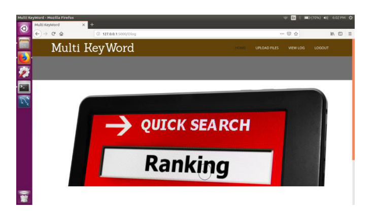
Fig-8:Owner Home page